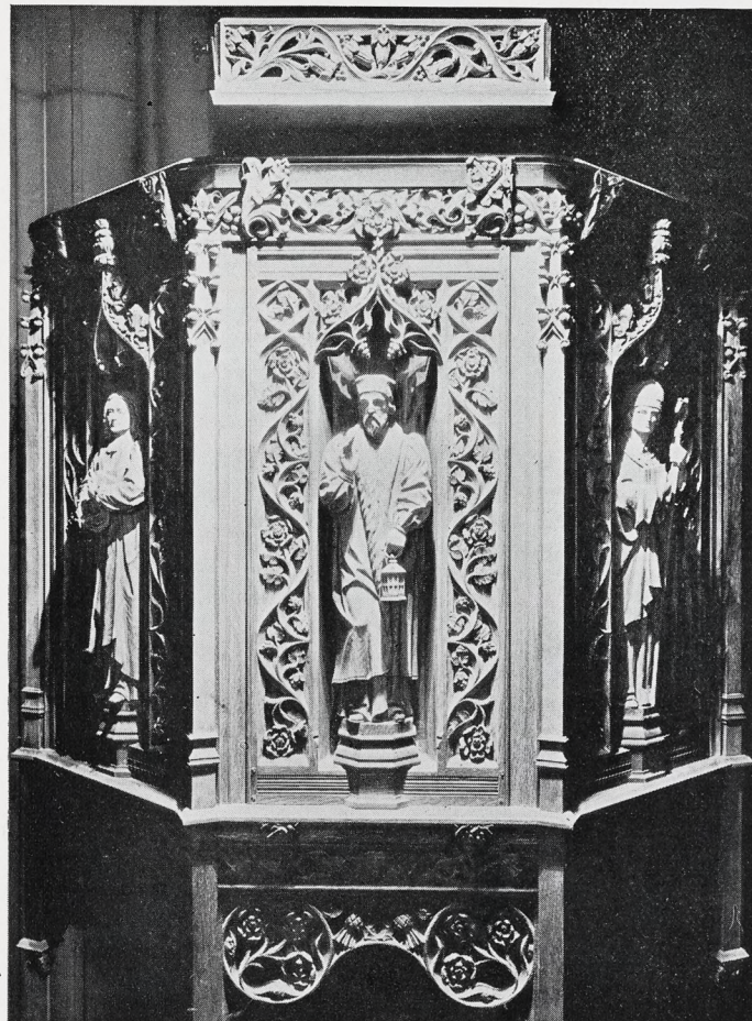
DETAIL OF ST. JAMES PULPIT