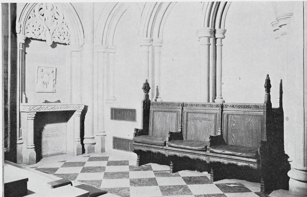
THE CREDESCENCE AND SEDILIA OF ST. JAMES CHURCH

and consume them as Elias did." No, at the very height of all our burning indignation against cruelty and wrong, we were called upon, as Christians, to love even the oppressors, to do good even to those who hated us, to pray for those that persecuted us, to be ready at last to go to the bitter end of crucifixion in divine love until we could say, "It is finished."