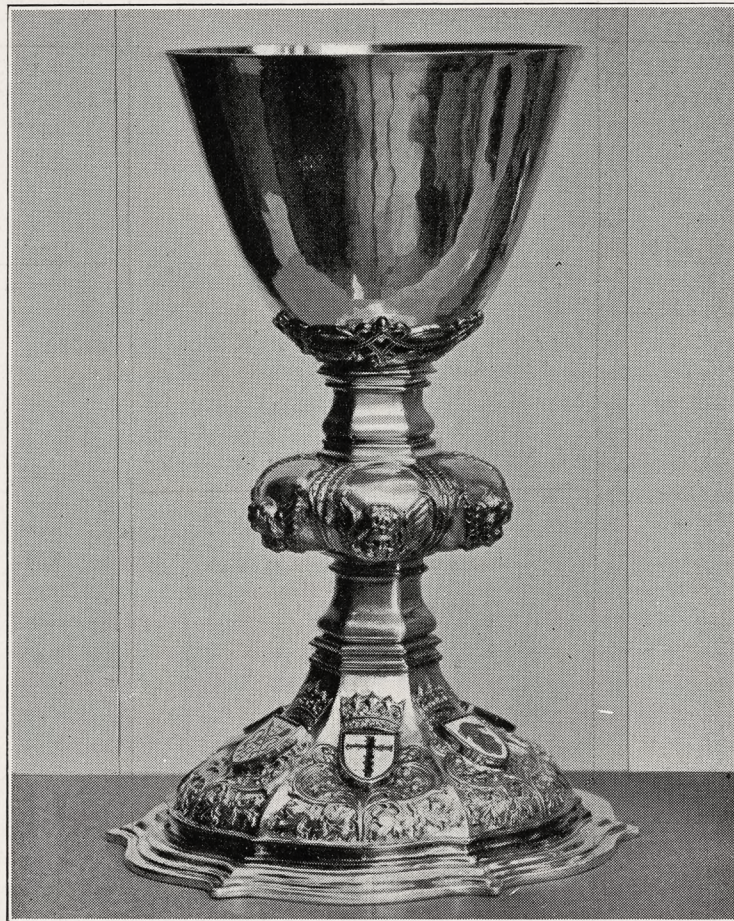
A MEMORIAL CHALICE The Work of the Craftsmen's Guild