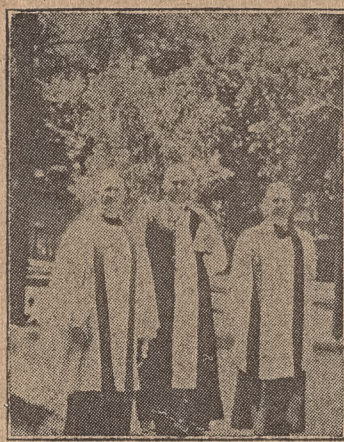
THE BISHOP AND CLERGY VISIT THE SCHOOL

The religious teaching of the school is the definite presentation of each boy's personal relation and loy-